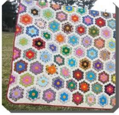
69" x 88" Antique Quilt