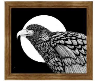
Artwork by Jeff Carr, pen & ink artist 14" x 19" (limited run of 25)