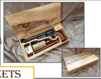
Replica 1860 Army Revolver with handmade wood case & accessories